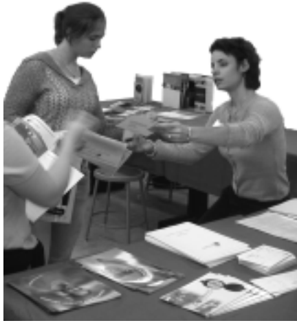
FAC students & college representatives discuss life after high school.