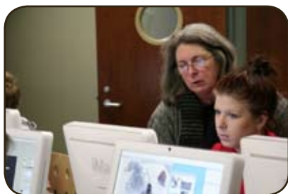
Top: Digital portfolios designed by photography students