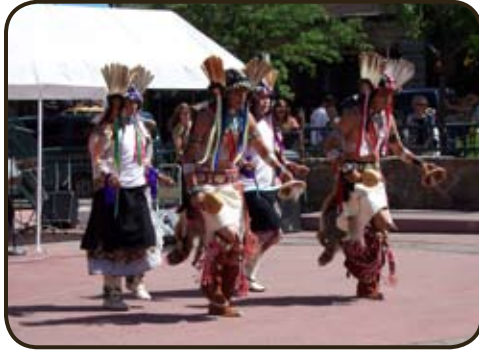
Hopi dancers in Flagstaff