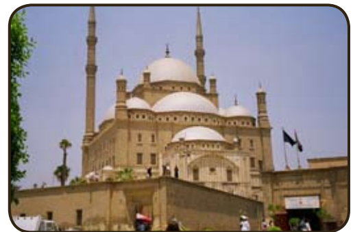
The Mosque of Mohammed Ali