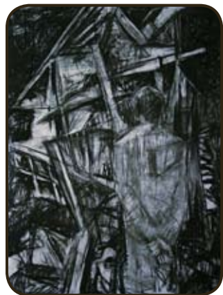
Birdhouse Reconsidered #1

Visual Artist Glen Miller will create a drawing exhibit in the Sheffield Wood Gallery from November 12 through January 4 with a closing reception on January 4,