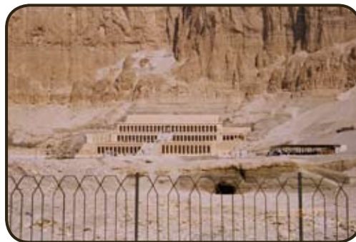
The Temple of Hatshepsut