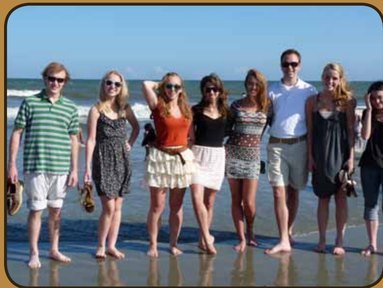
Spoletto field trip