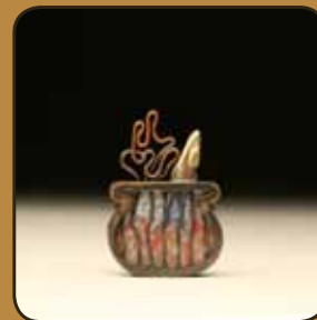
Student work from 2009 National Juried Metals Exhibition